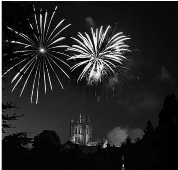
Fireworks celebrating the relighting of the cathedral