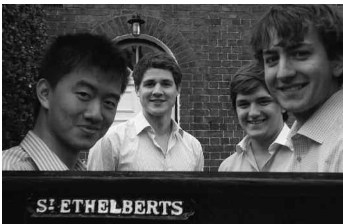
Hereford Cathedral's 2011/2 organ and choral scholars outside St Ethelbert's House

The Palace Art-fest, a musical evening and our ever-popular clay pigeon shoot, along with our annual Benefactors' Party, were some of this summer's events, which drew together our wide group of friends and supporters. Thank you to all those who helped stage these various events, to our hosts in particular for opening up their homes to us and to all those who supported each of the events. It would not be worth arranging any of them without your constant and continuing support and encouragement.